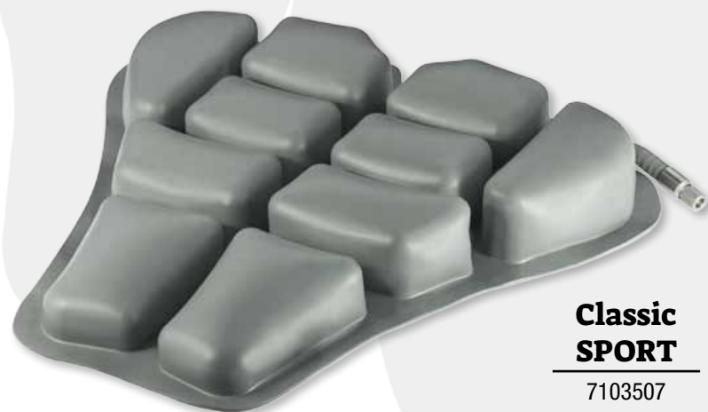
Classic SPORT 7103507