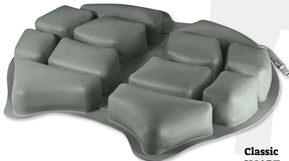
Classic SMART 7103504