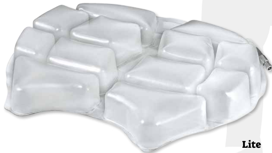
Lite SMART 7103502