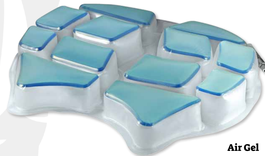
Air Gel SMART 7103503