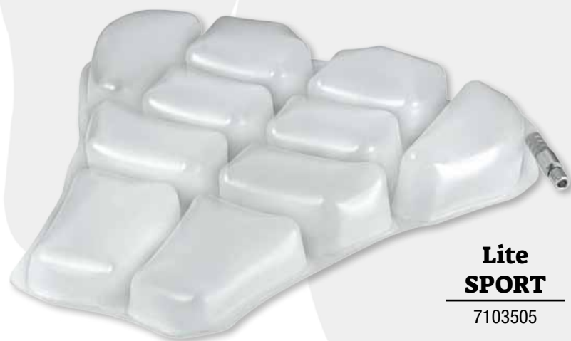
Lite SPORT 7103505