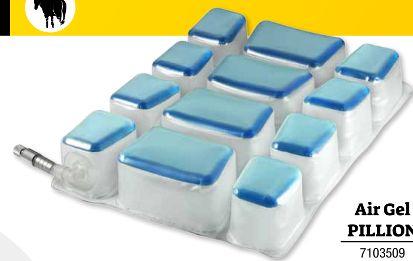
Air Gel PILLION 7103509