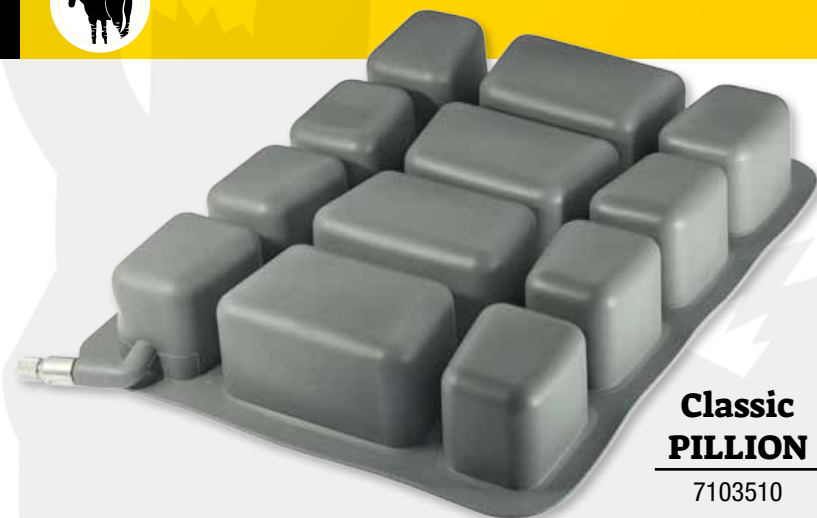
Classic PILLION 7103510