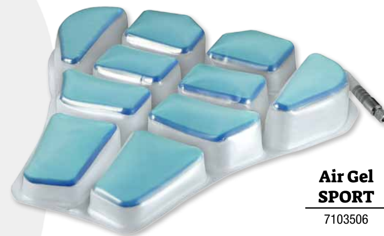
Air Gel SPORT 7103506