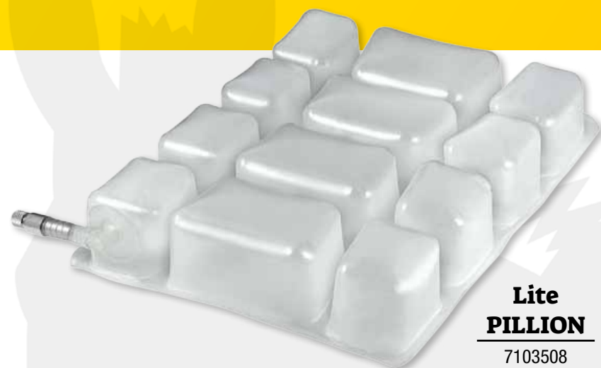
Lite PILLION 7103508